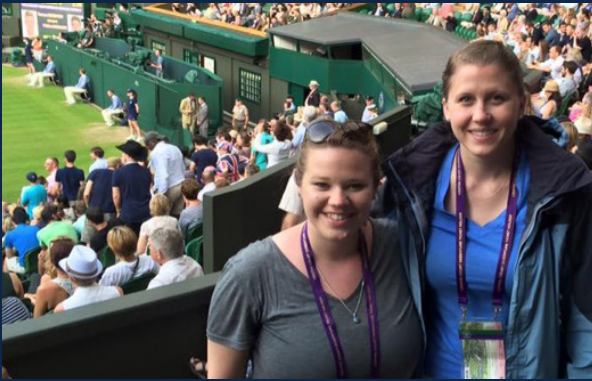
At Wimbledon in London