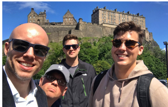
Guy's weekend in Scotland