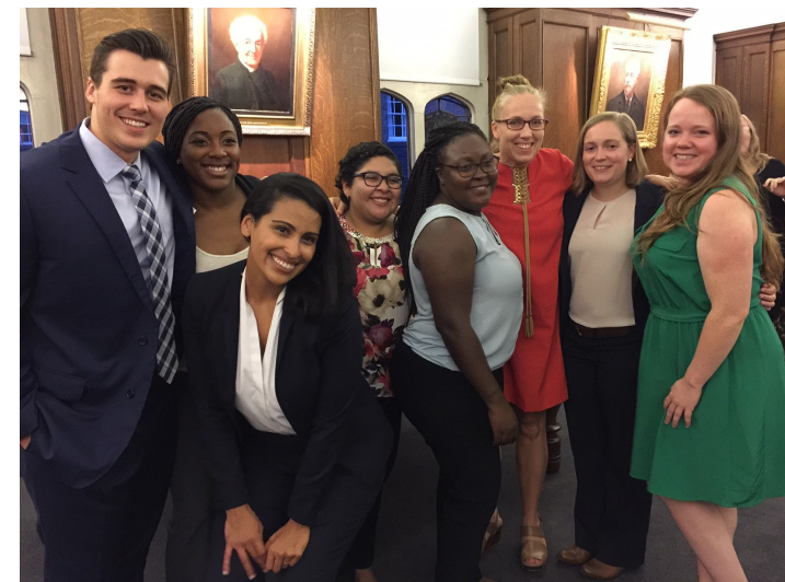
At the closing dinner