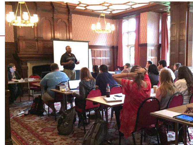
Class in session at Sidney Sussex College

Information concerning casebook materials for courses offered will be available in sufficient time to allow some preparation by students prior to the summer semester. Individual students who wish to have course materials for early preparation should request the necessary information from the program director. Students should purchase their casebooks before leaving the U.S. and bring those to Cambridge.