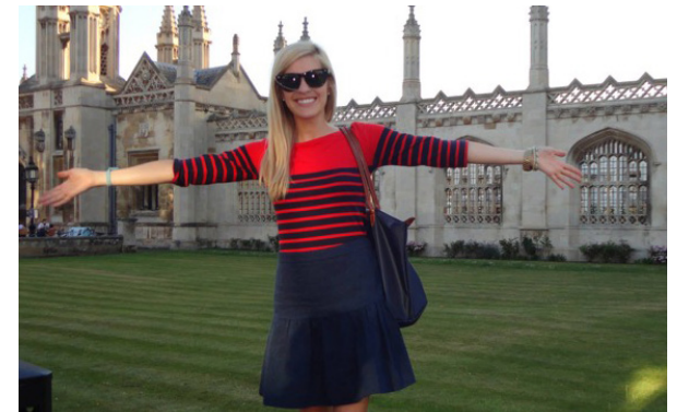
So much history!