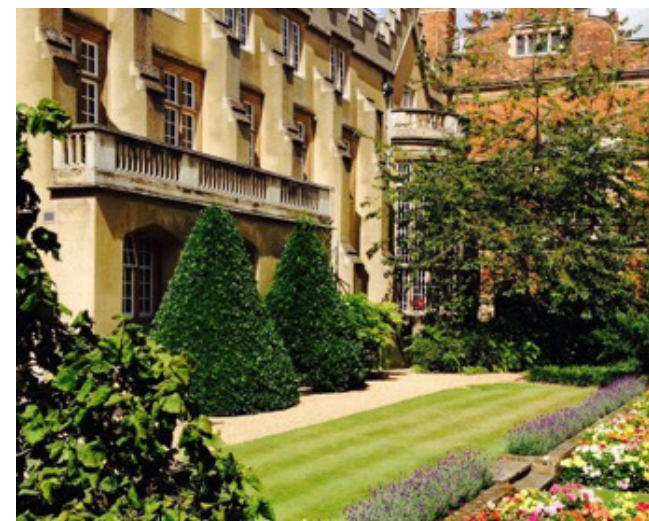
The gorgeous gardens at Sidney Sussex College