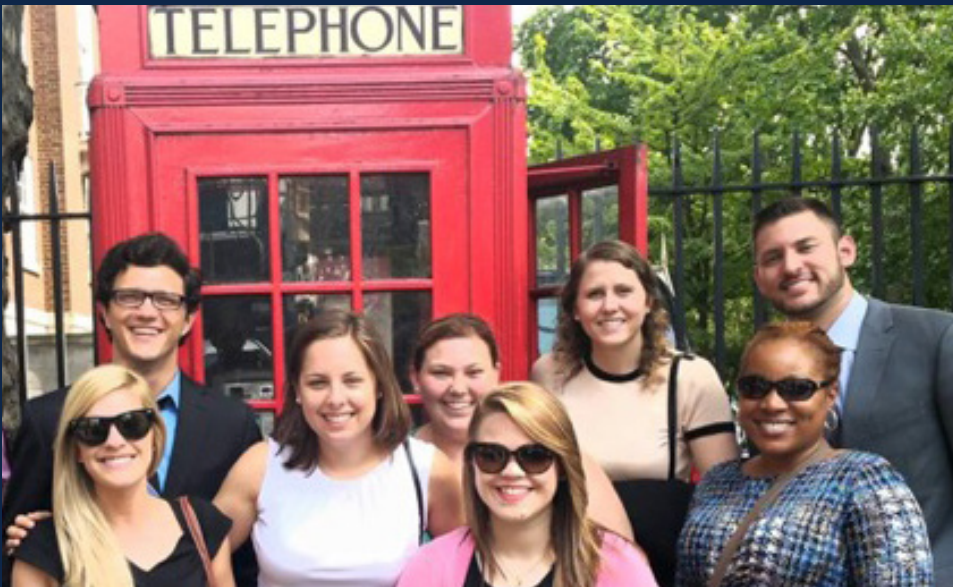
Seeing the sights of London