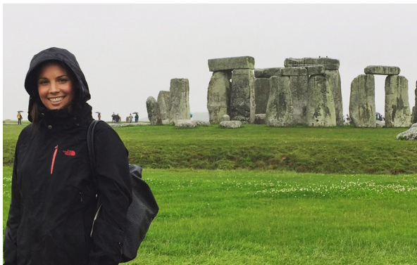
Quick trip to Stonehenge

But, why would you want to cancel the chance to have opportunities like these?