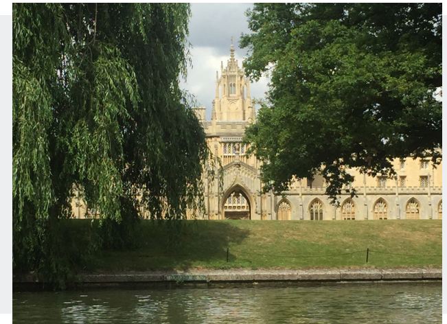
Just a few of the sites of lovely Cambridge