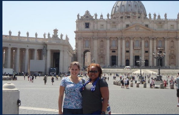
Weekend in Rome